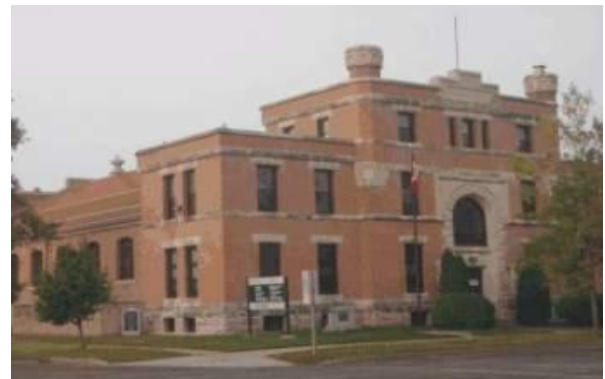
Figure 1 Brandon Armoury opened 1907