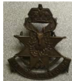
Figure 2 99 th Manitoba Rangers Badge

The 26th Field Regiment RCA perpetuates a number of units and can be traced to the 99th Manitoba Rangers, which were organized in April 1908.