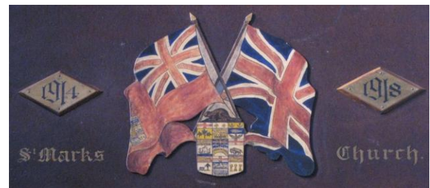
Figure 2 St Marks Church Minnedosa Roll of Honour WWI