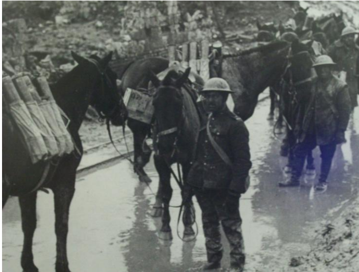
Figure 12 Canadian Expeditionary Force soldiers transport Ammunition for the barrage on Vimy Ridge

The Battle of Vimy Ridge was a military engagement fought during the First World War from 9 to 12 April 1917. The Canadian Corps of four divisions, fought against three divisions of the Imperial German Sixth Army. The objective of the Canadian Corps was to take control of the German-held high ground along an escarpment. The Canadian Corps captured most of the ridge during the first day of the attack. The crest of the ridge fell on the second day, once the Canadian Corps overcame considerable German resistance. The final objective, a fortified knoll located outside the town of Givenchy, fell to the Canadian Corps on 12 April. The success of the Canadian Corps in capturing the ridge is attributed to a mixture of extensive training, technical and tactical innovation, meticulous planning and powerful artillery support. The battle was the first occasion when all four divisions of the CEF Canadian Expeditionary Force fought a battle together and thus became a Canadian Symbol of achievement and sacrifice. A portion of the former battleground now serves as a preserved memorial park and site of the Canadian National Vimy Memorial.